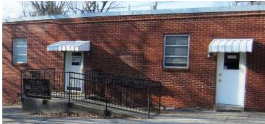
Before the repairs, the rear of Lang House looked shabby and unwelcoming.

Thanks to all of the League members who donated hundreds of volunteer hours to turn Lang House back into a great source of pride! Your effort has made such a big difference, as you can see below.